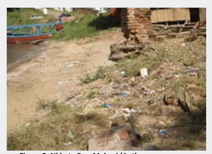
Figure 2: Nkhata Bay, Malawi (Authors

Improvement of rural sanitation issues through the private sector is supported at the national level. Private sector participation in the delivery of sanitation and hygiene services in Malawi is directed by the National Water Policy (Malawi Government, 2005), National Sanitation Policy (Malawi Government, 2008), Microfinance Policy and Action Plan (Malawi Government, 2002), and the Public Private Partnership Framework (Malawi Government, 2011b), with the latter including sanitation as a specific business growth area.